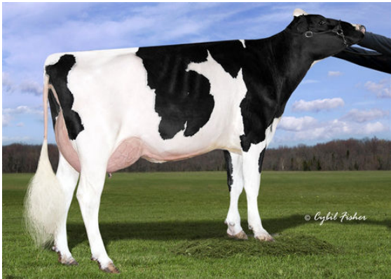
SIEMERS DELTA S-ROZ-ANN DAM