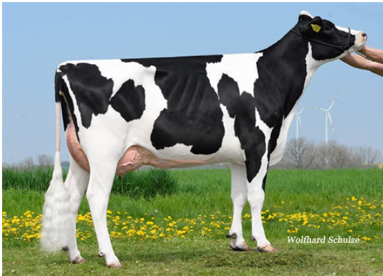
NM PODEST DAM