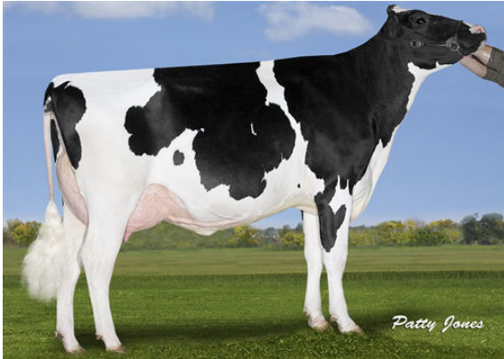
MAPEL WOOD CGAIN LOTTO P GRANDDAM