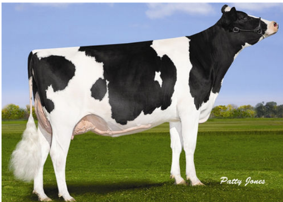
MAPEL WOOD M O M LUCY FOURTH DAM