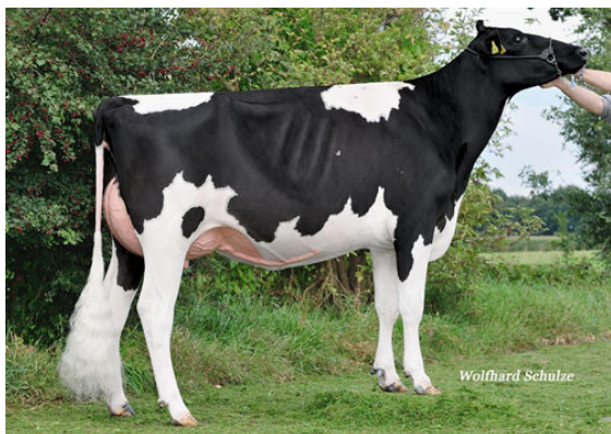
CCC COMMANDER SUMMER DAM