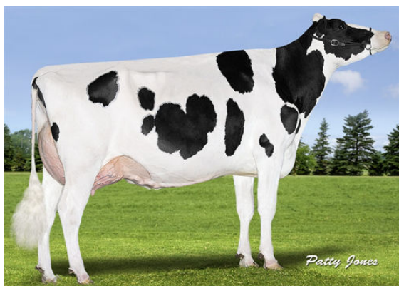
WALNUTLAWN MCCUTCHEN SUMMER GRANDDAM