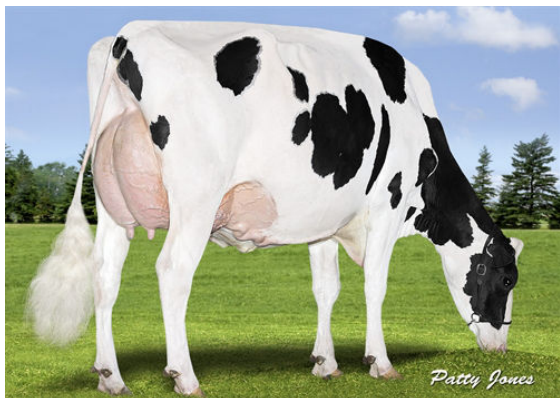
WALNUTLAWN MCCUTCHEN SUMMER GRANDDAM