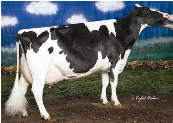
SAVAGE-LEIGH LOUISE FIFTH DAM