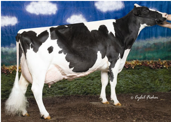
SAVAGE-LEIGH LOUISE FIFTH DAM