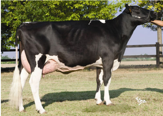
ALL.NURE ELEGANT BULLESTAR FOURTH DAM