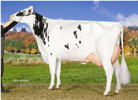
ANDERSTRUP SNOW HEAVEN DAM