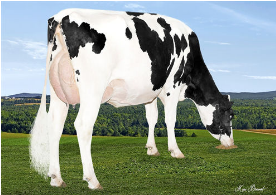
DUTEAU ALBUM INGRID