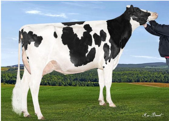
DUTEAU ALBUM INGRID