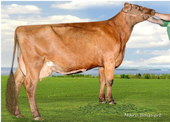
MARDEL OBLIQUE MIA-MI 28