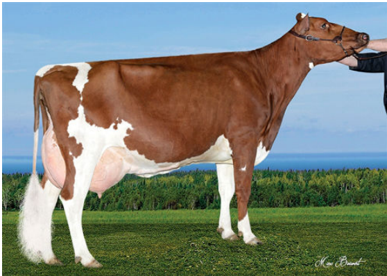
MARGOT CHOCOLATE DAM