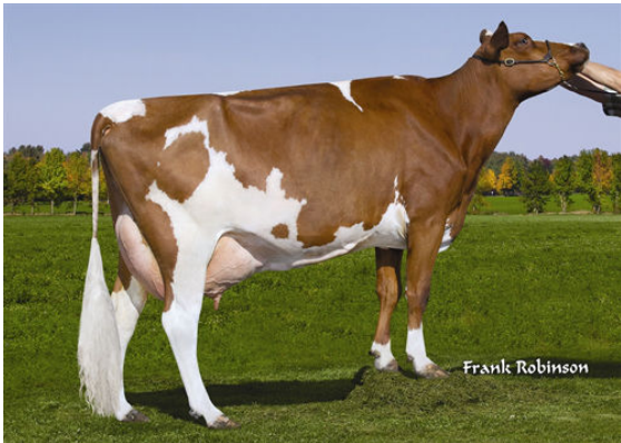
COCK ROND PETERSLUND TOVER'S GRANDDAM