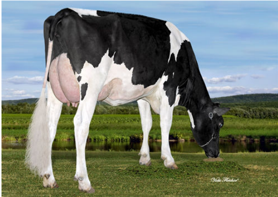
AIJA KING-DOC WICHITA DAM