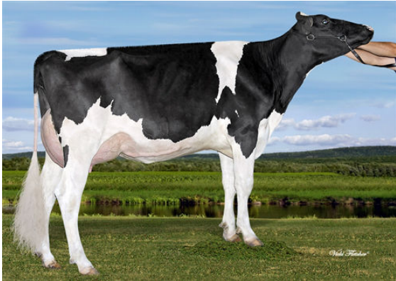
AIJA KING-DOC WICHITA DAM