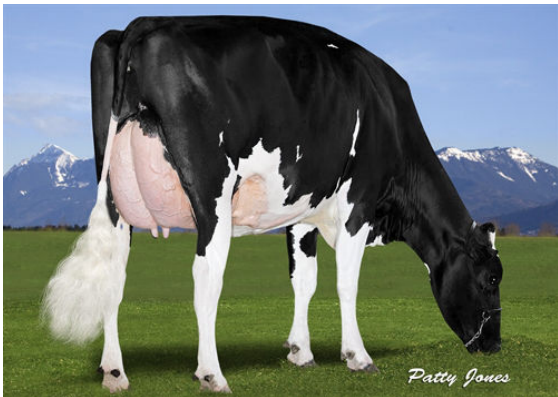
VIEW-HOME DRMAN WSCONSIN THIRD DAM