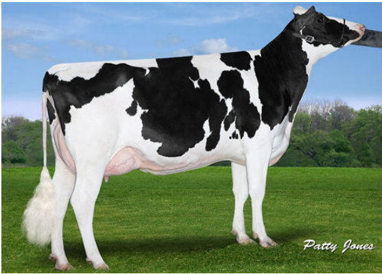
CLAYNOOK DAWNETTE HUNTER