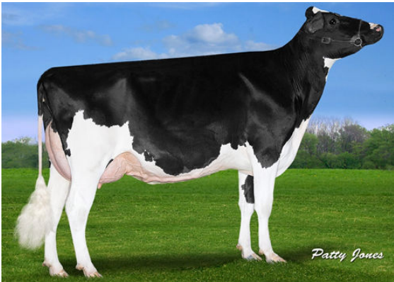
CLAYNOOK DIVINITY UNIX