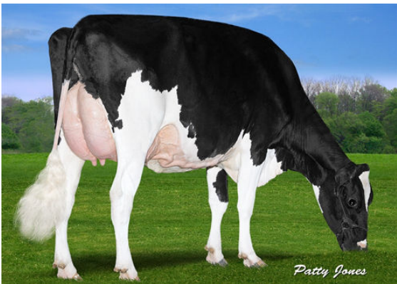
CLAYNOOK DIVINITY UNIX