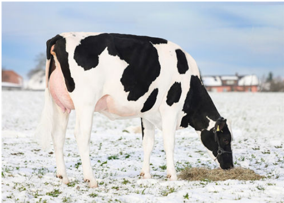
REBIN GENIE CAMBOGIA