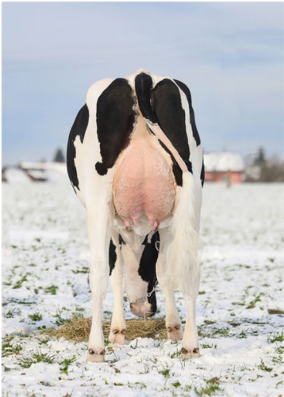
REBIN GENIE CAMBOGIA