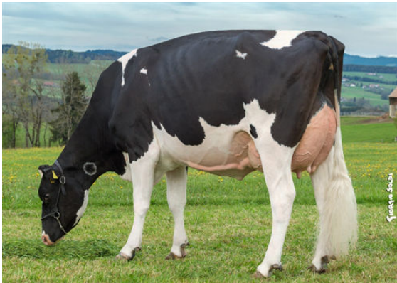
CASTEL MOGUL TALINI DAM