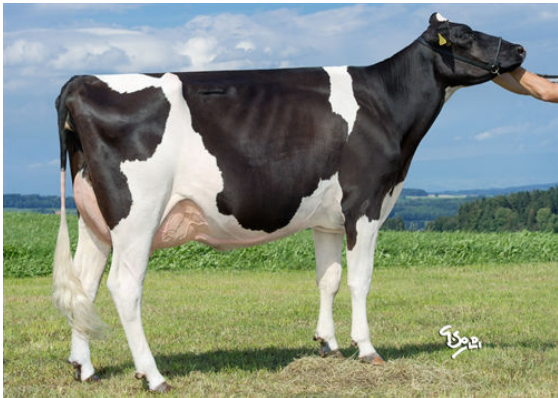
CASTEL MOGUL TALINI DAM