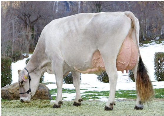
ADRIAN'S CALVIN ELANA DAM