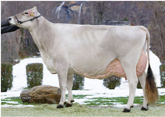
ADRIAN'S CALVIN ELANA DAM