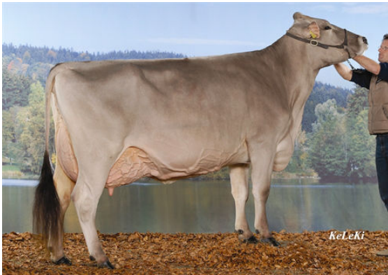
ARVE FOURTH DAM