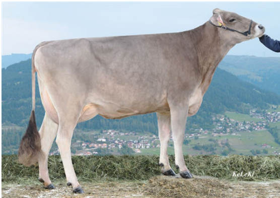
JOLAHOFS MORILLO ARVE DAM