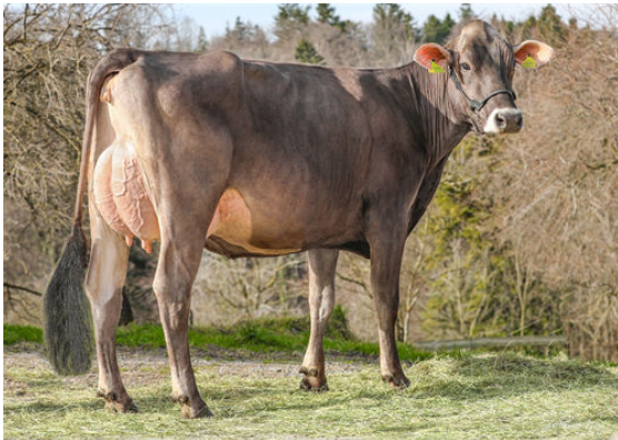
ZGRAGGEN BS AMIR AMSEL DAUGHTER