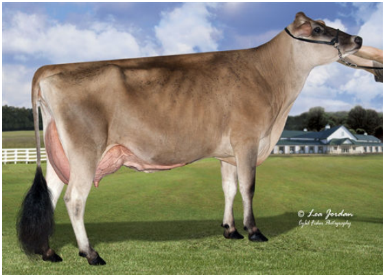
JX RIVER VALLEY DISCO CHERITA 5154 {6}