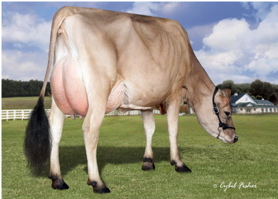
JX RIVER VALLEY CHROME CHERITA 1261 {5}