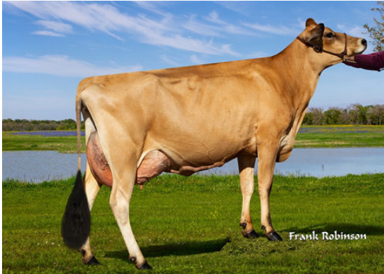
JX LUCKY HILL WILDFLOWER {6} GRANDDAM

RIVER VALLEY MAC MARGIN VIERRA JASMINE VG-85%-2YR-USA KASH-IN SUGAR DADDY JX LUCKY HILL WILDFLOWER {6} EX-90%-5YR-USA JX AHLEM HARRIS BALTAZAR {5} LUCKY HILL BALLISTIC WINNIE VG-85%-3YR-USA