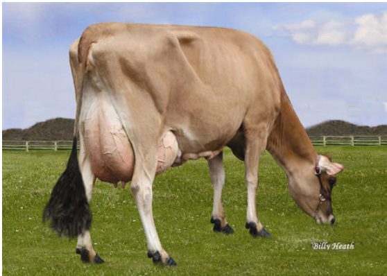
LUCKY HILL JOKER WABORITA FOURTH DAM