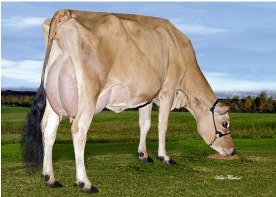
SUN VALLEY MAGNUM BELLITA FOURTH DAM