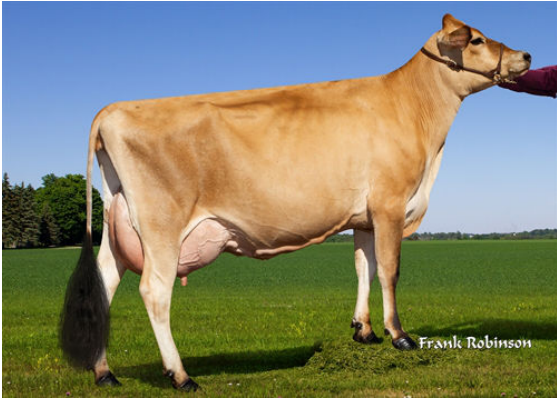
JX PROGENESIS BEATRICE {5} DAM