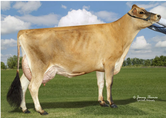
PROGENESIS CYRUS BUTTON GRANDDAM