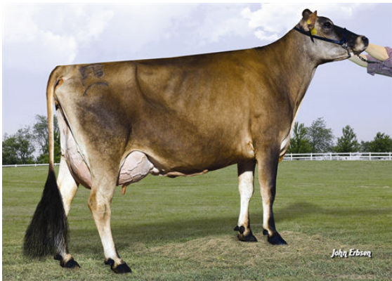
JX FARIA BROTHERS TARGET RONAL GRANDDAM