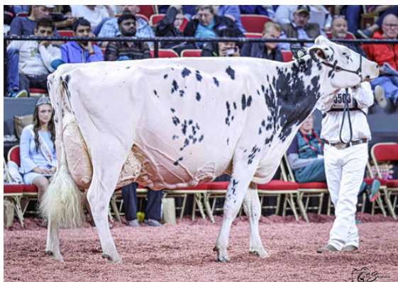
ERBACRES SNAPPLE SHAKIRA DAM