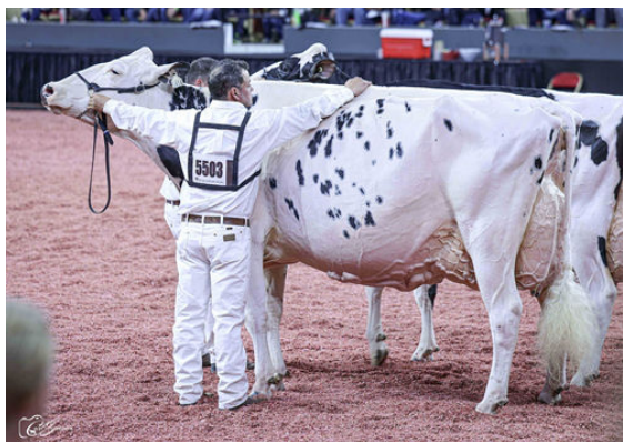
ERBACRES SNAPPLE SHAKIRA DAM