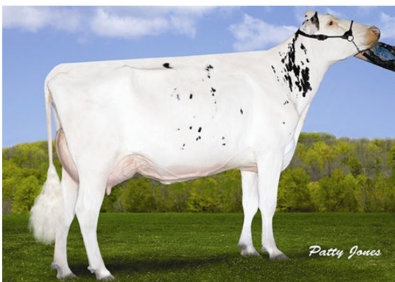
VELTHUIS S G SNOW EVENING FIFTH DAM