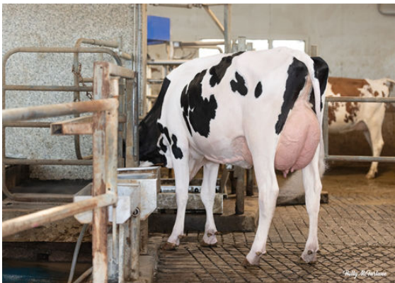
PROGENESIS JALAPENO PEPPY DAM