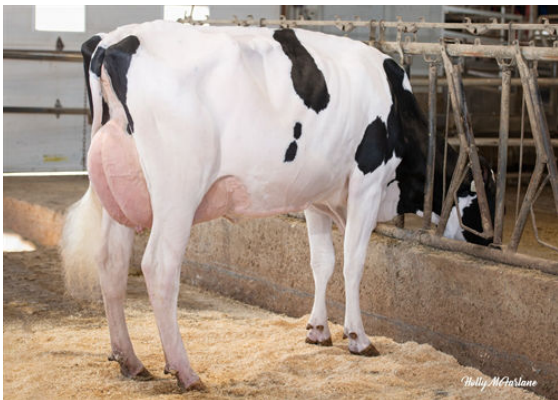
PROGENESIS JALAPENO PEPPY DAM