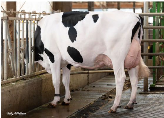
PROGENESIS ZAZZLE PRACTICE GRANDDAM