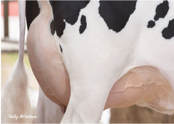
COOKIECUTTER A HOMILY GRANDDAM