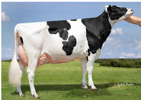
KINGS-RANSOM KROY CLIMAX GRANDDAM