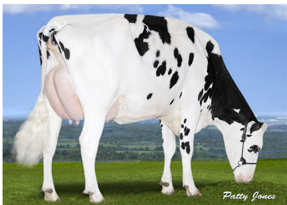
PEAK BOMBERO MAXIMA FIFTH DAM