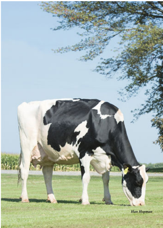
KINGS-RANSOM MG CLEAVAGE THIRD DAM