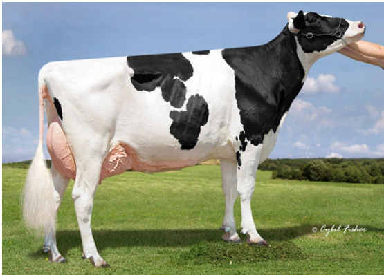
KINGS-RANSOM KROY CLIMAX GRANDDAM