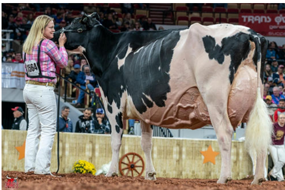
JACOBS LAUTHORITY LOANA THIRD DAM