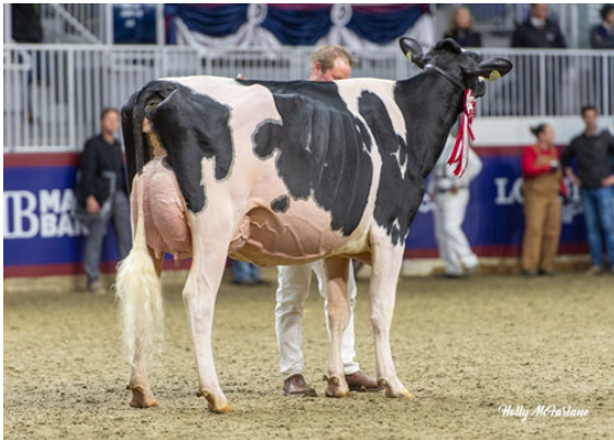
JACOBS ALLIGATOR LORELLA DAM