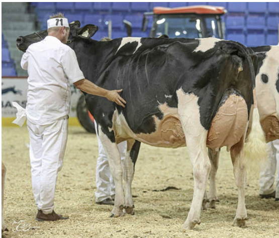
JACOBS SIDEKICK LOONY GRANDDAM