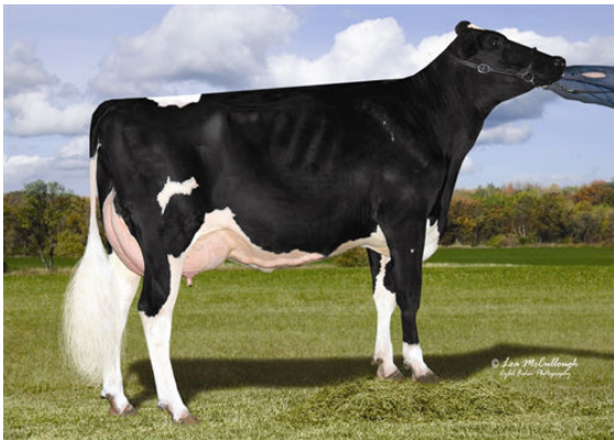
COOKIECUTTER MOM HALO FIFTH DAM