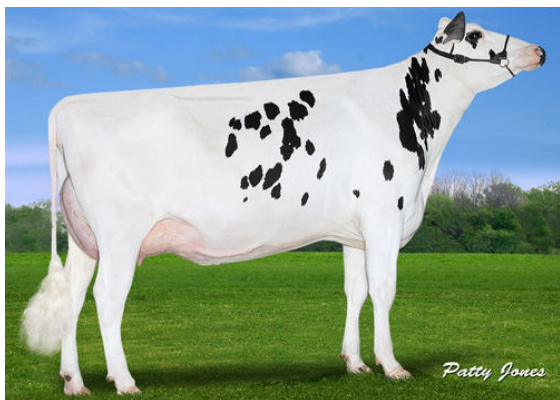
CLAYNOOK COLITA BOMBERO FOURTH DAM