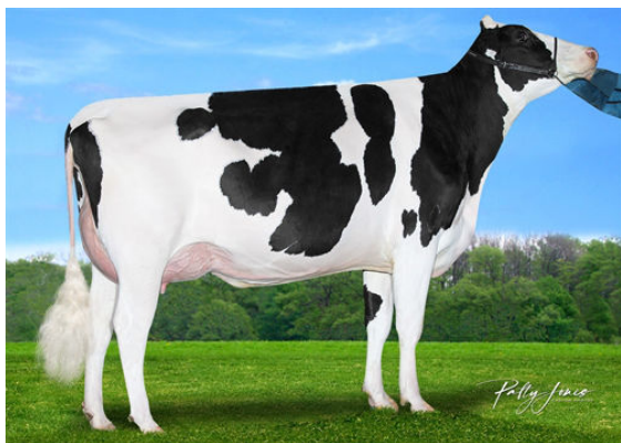
CLAYNOOK CHRIS RENEGADE DAM