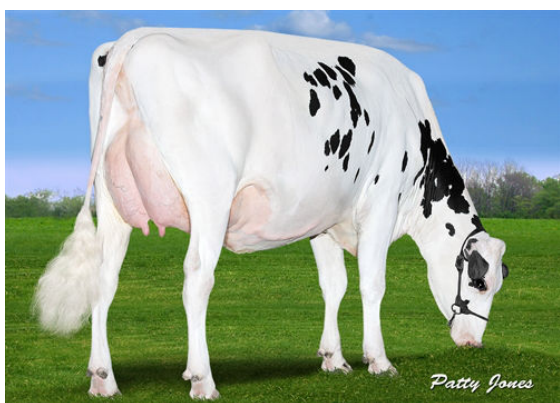
CLAYNOOK COLITA BOMBERO FOURTH DAM