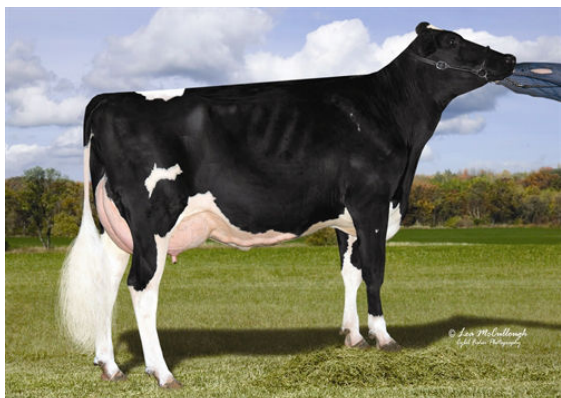
COOKIECUTTER MOM HALO FIFTH DAM