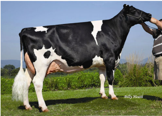
JUNIPER GOLDWYN WISTFUL FIFTH DAM