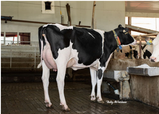
PROGENESIS GUARANTEE OSTARA GRANDDAM