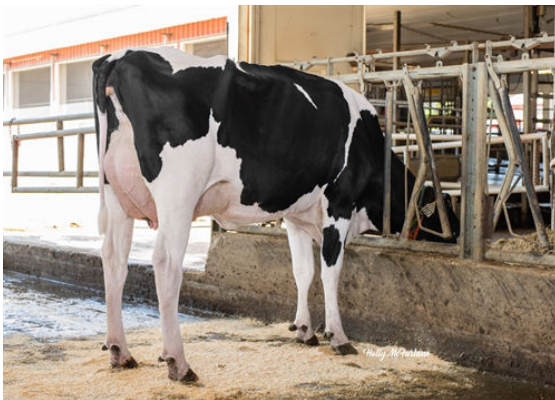
PROGENESIS GUARANTEE OSTARA GRANDDAM