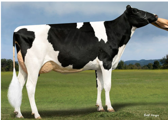
PROGENESIS DENVER OOBLECK THIRD DAM