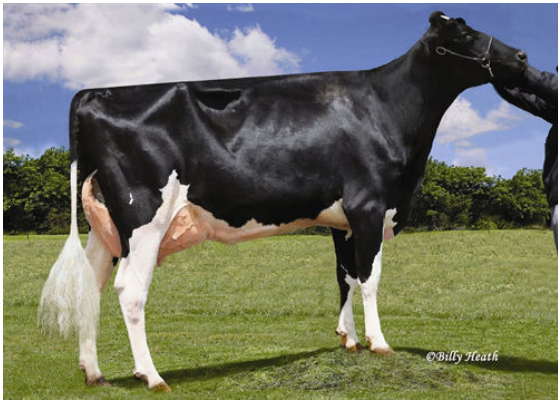
LADYS-MANOR ALLANAS DORA FIFTH DAM