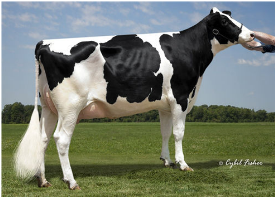
EDG RUBY UNO RAE 2054 FOURTH DAM