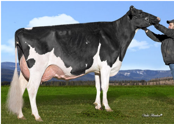
TAPPENVALE MISS UNIVERSE DAM