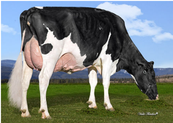
TAPPENVALE MISS UNIVERSE DAM