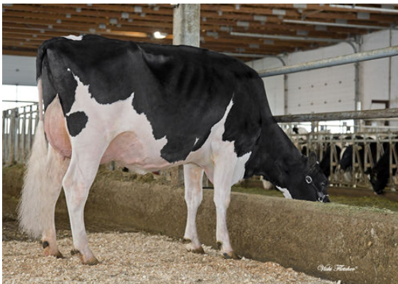
TAPPENVALE MISS UNIVERSE DAM