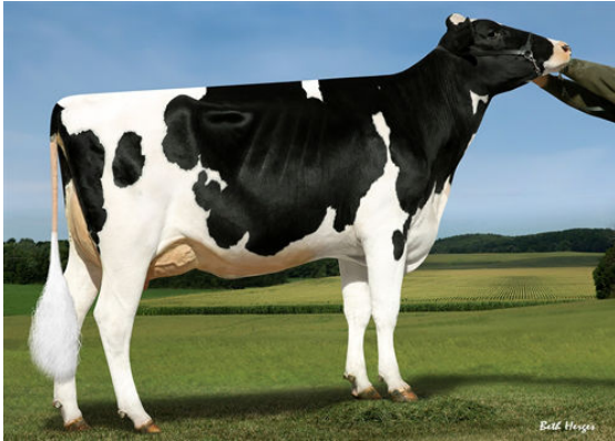
SANDY-VALLEY RBCN LOGAN GRANDDAM