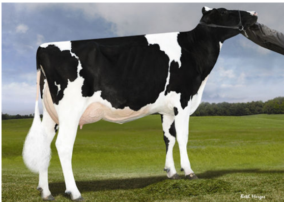
LADYS-MANOR S DAHLIA FIFTH DAM