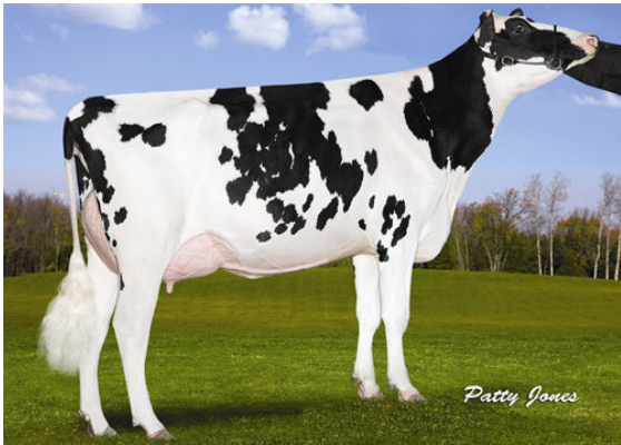
OCD MOGUL FUZZY NAVEL FOURTH DAM