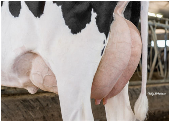
PROGENESIS FABULOUS BRISK DAM