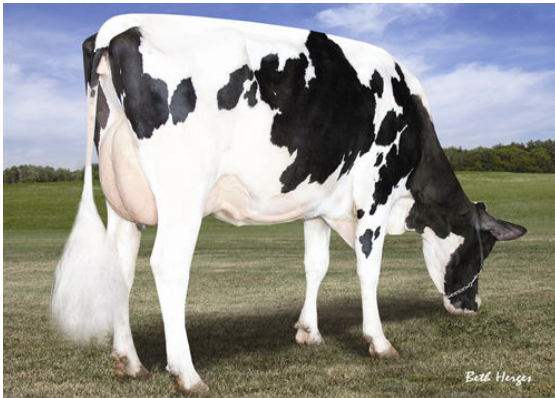
APPLIOUS JET STREAM ALDA FIFTH DAM