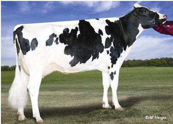
APPLIOUS JET STREAM ALDA FIFTH DAM