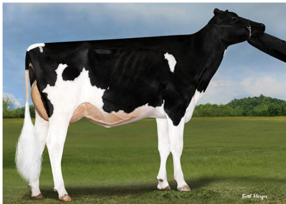
PROGENESIS DOORSOPEN HAZEL