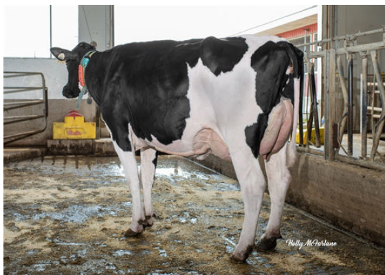
PROGENESIS IMAX HIJINKS