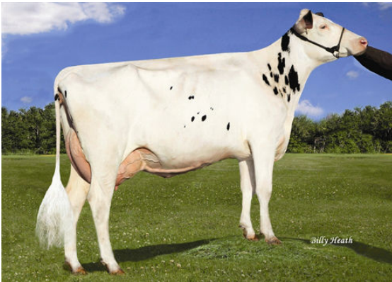
RICHMOND-FD BARBIE FIFTH DAM