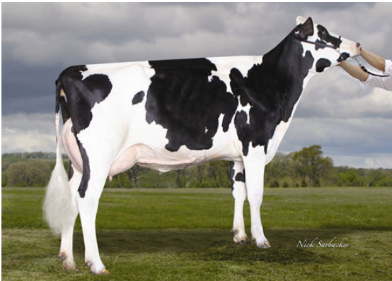
RICHMOND-FD S BARBARA FOURTH DAM