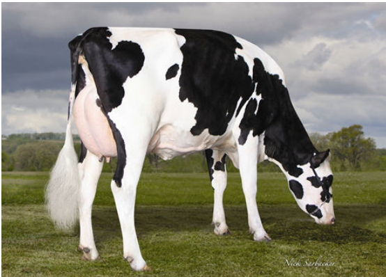
RICHMOND-FD S BARBARA FOURTH DAM