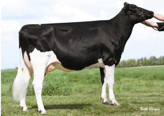
GRANDEUR GW TRILLIAN FIFTH DAM