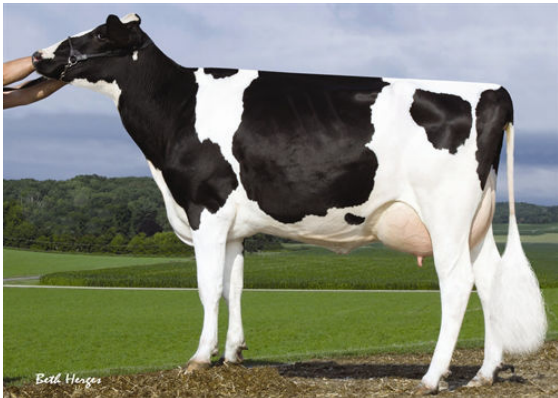
SANDY-VALLEY PLANE SAPPHIRE FOURTH DAM