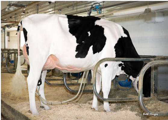
REGAN-DANHOF JEDI CASHMERE DAM