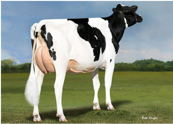
REGAN-DANHOF JEDI CASHMERE DAM