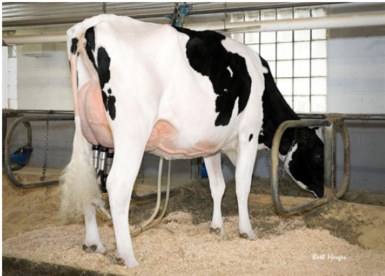
REGAN-DANHOF JEDI CASHMERE DAM