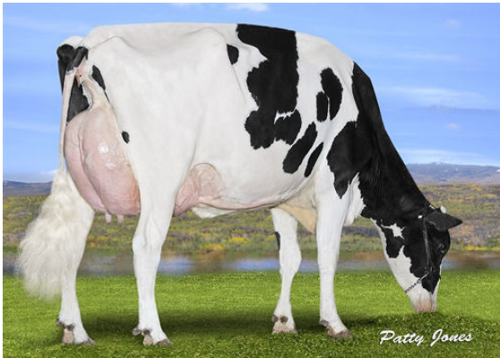
PROGENESIS DENVER BETSY GRANDDAM