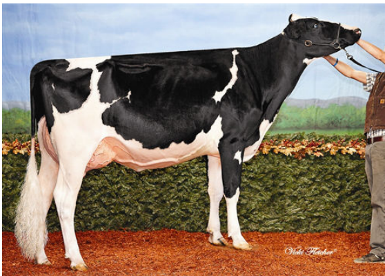
RALMA-RH MANOMAN BANJO FIFTH DAM