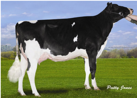
MS LOOKOUT PESK BKM BRIA FOURTH DAM