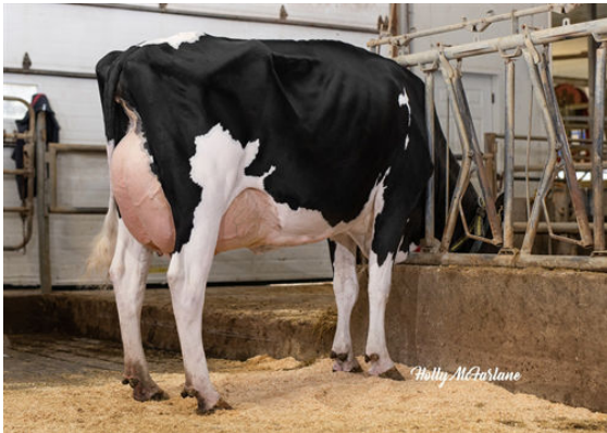
PROGENESIS SUPER BEAST DAM